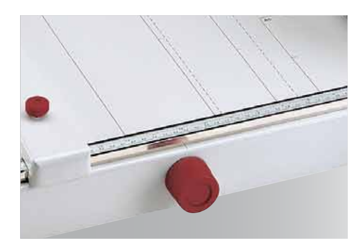
CALIBRATED ROTARY KNOB The front gauge can be positioned precisely to the desired dimension via the calibrated rotary knob.