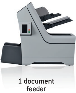
1 document feeder