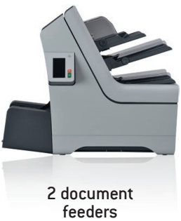
2 document feeders