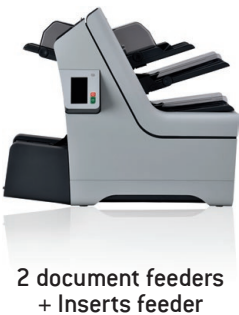
2 document feeders + Inserts feeder