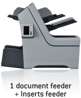
1 document feeder + Inserts feeder