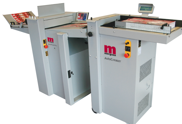
Picture shows AutoFold Pro with Morgana AutoCreaser

The beauty of the AutoFold Pro is its simplicity allowing the user of ANY manufacturer's creaser to invest in one and to improve their productivity and quality immediately.